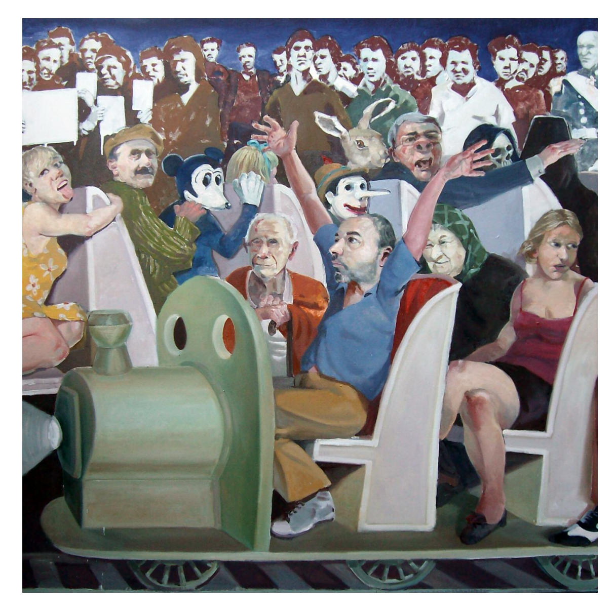
The Ghost Train[ 2014] Oil on canvas 148x148 cm