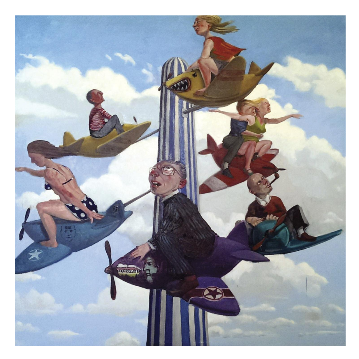
High Flyers [2014] Oil on canvas 148x148 cm