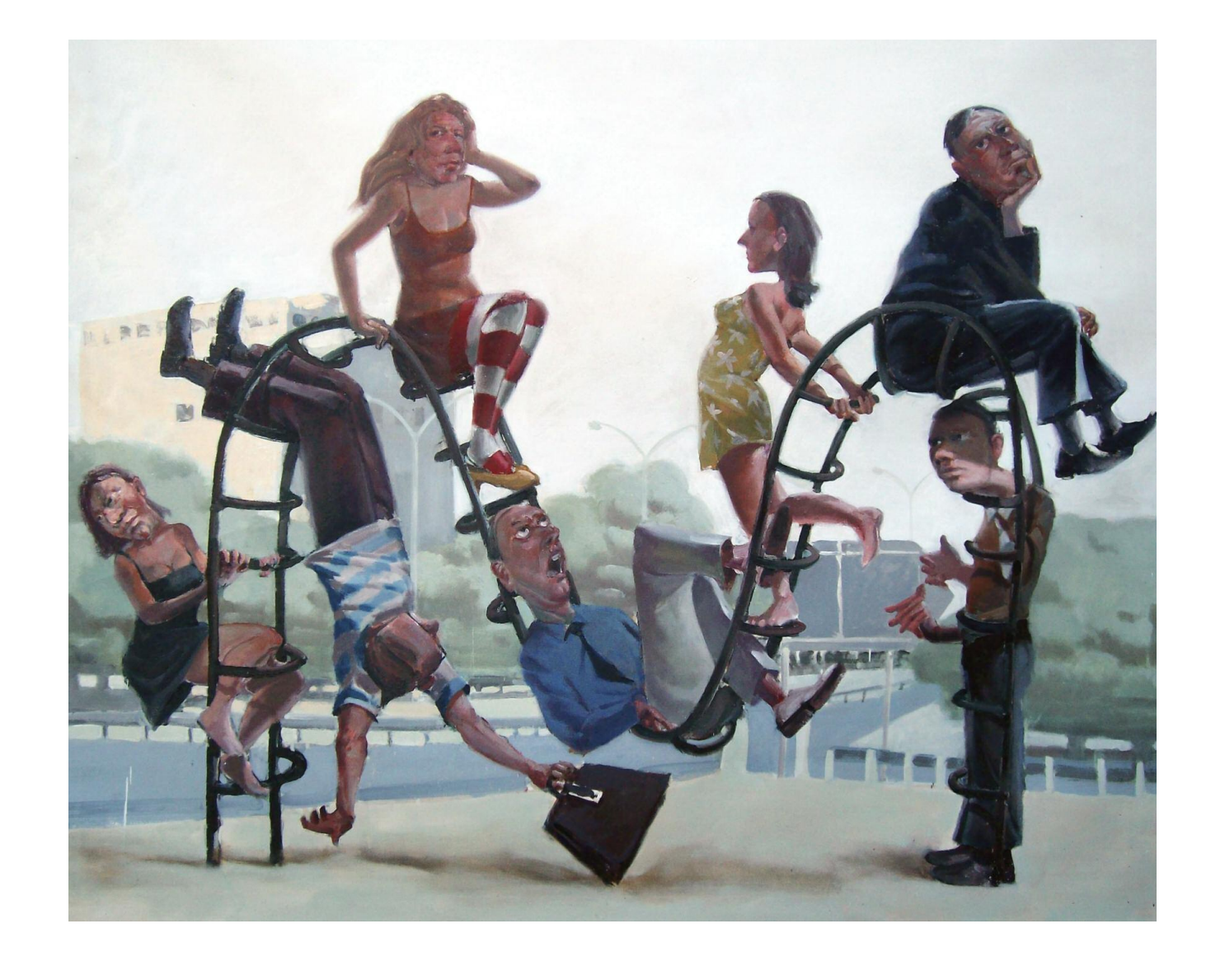
Train [2014] Oil on canvas 125x148 cm