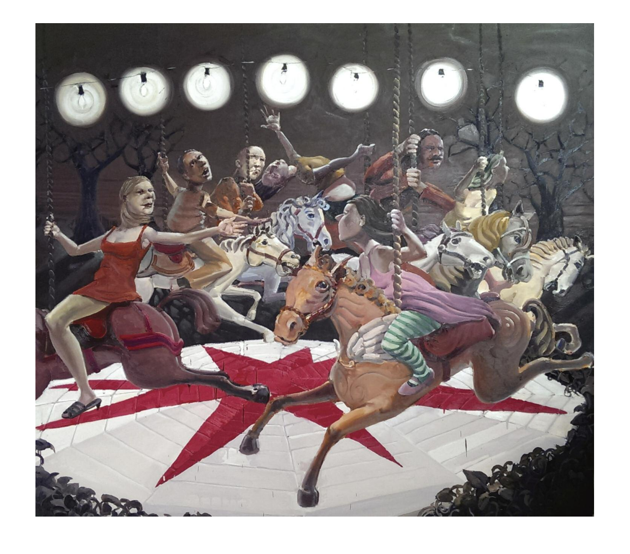
Traffic [2014] Oil on canvas 130x148 cm