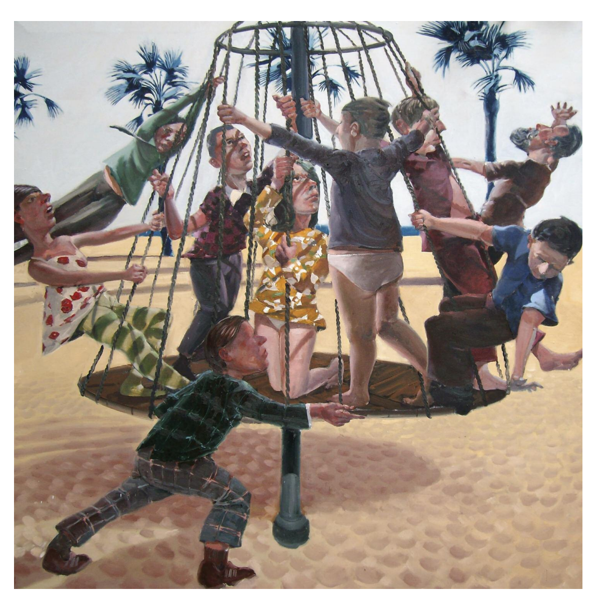
The Witche's Hat [2014] Oil on canvas 148x148 cm